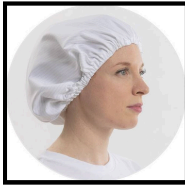
Hair nets re-usable