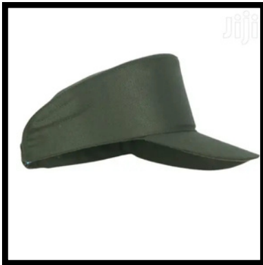
Security jembe caps