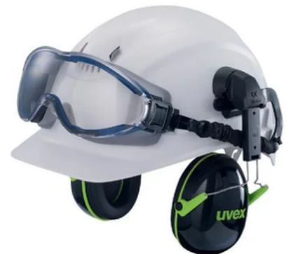
Helmet with earmuffs and goggles