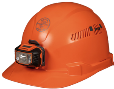
Hard Helmet with Affixed Light

Head Protection Accessories enhance the safety and functionality of helmets by providing added comfort, visibility, and protection in diverse work environments.