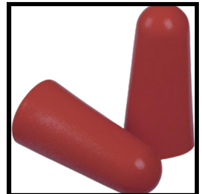
Disposable Ear Plugs