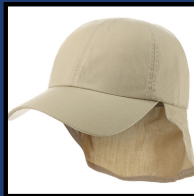
Nomad Safari Cap