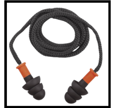
Reusable Ear Plugs

For staff working in dual-function roles—such as cleaners or maintenance personnel moving between quiet and noisy zones—reusable or easy-to-wear ear protection is ideal. Providing the right ear protection not only supports worker safety but also ensures better focus, reduced fatigue, and overall compliance with occupational health standards.